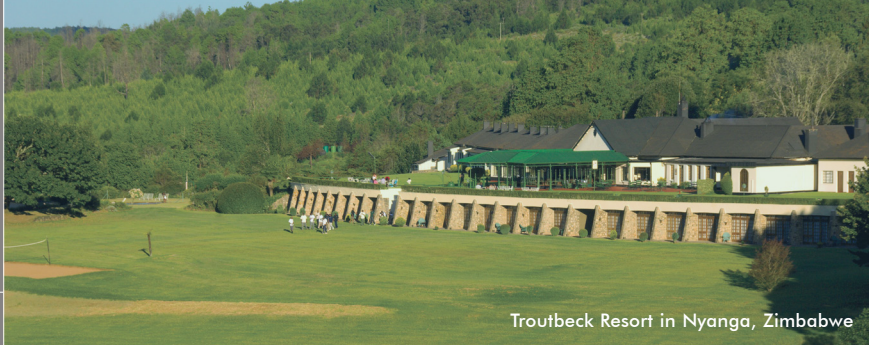
Troutbeck Resort in Nyanga, Zimbabwe