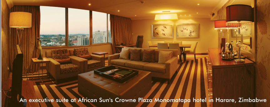
An executive suite at African Sun's Crowne Plaza Monomatapa hotel in Harare, Zimbabwe